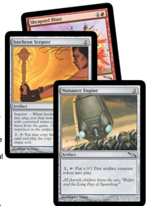
Not exactly low profile...

I promised one of my readers I'd make a cool tribal deck (and I have, although I suspect that Volver.dec is no match for soldiers or zombies), but my first entry into MTGO multiplayer had to be in Prismatic. 250 card decks, 20 card minimums in each color, what could be better? (For