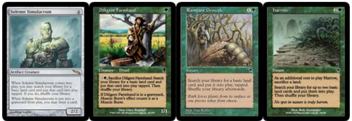
Mana fixing that comes with acceleration is very powerful in Prismatic

Card drawing. I may be a bit overboard on the straight card drawers, but they are key to making sure you've got plenty of action all through the game. Fortunately, like the mana fixers, most of the spells you want here aren't very expensive. Concentrate , Deep Analysis and Opportunity are all cheap to trade for if you don't want to go for Fact or Fiction . Allied Strategies is a wonderful card in a format where you're going to spend your first turns making sure you've got every type of basic land in play. Mind's Eye is also gross, although it tends to draw a lot of fire.